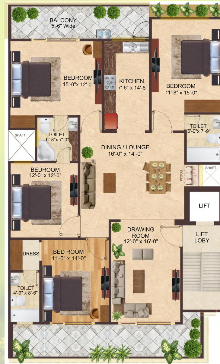
FLOOR PLAN LAYOUT | 4BHK (Type - B) 10.76mtr X 21.19mtr