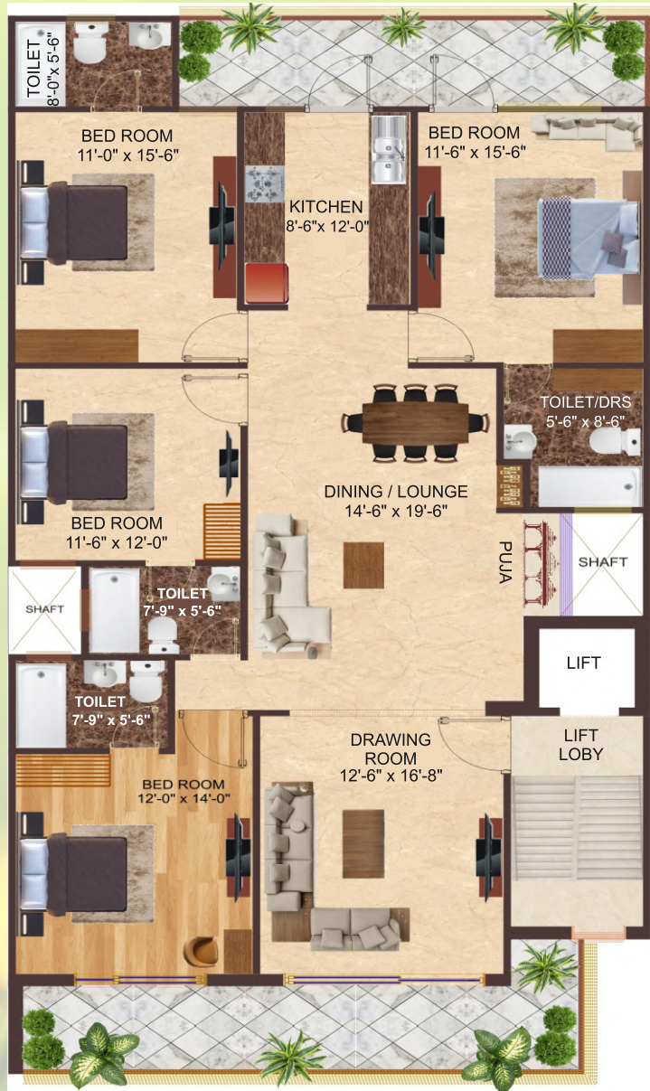
FLOOR PLAN LAYOUT | 4BHK (Type - A) 10mtr X 25mtr