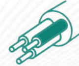
Underground Electricity Lines Wiring