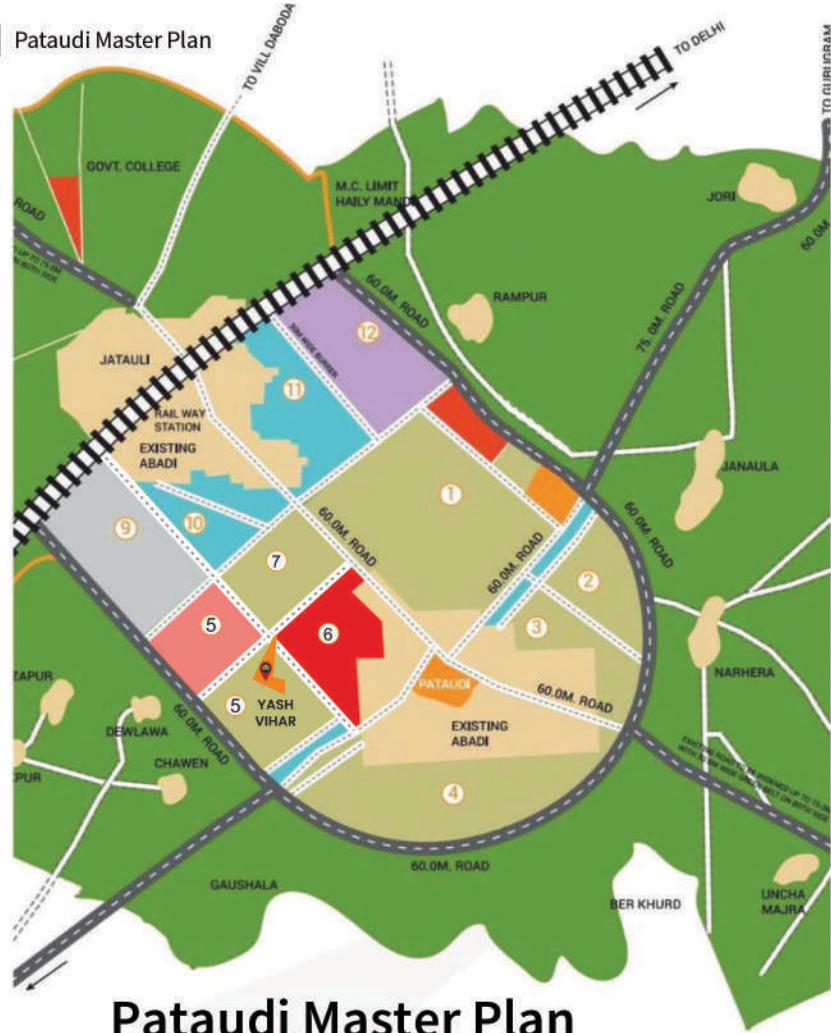
Pataudi Master Plan