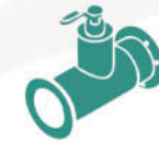
Underground Sewage Lines