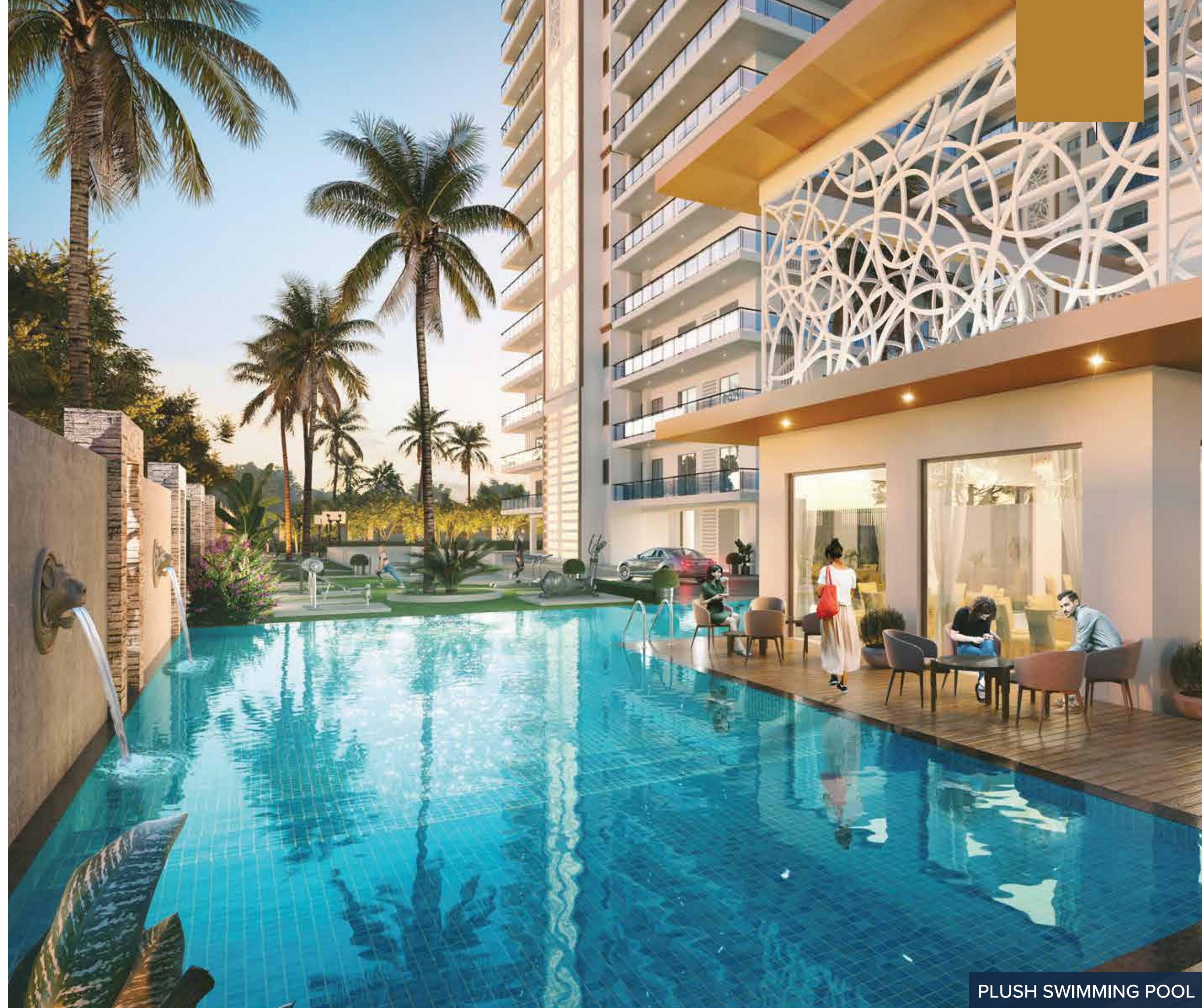
PLUSH SWIMMING POOL