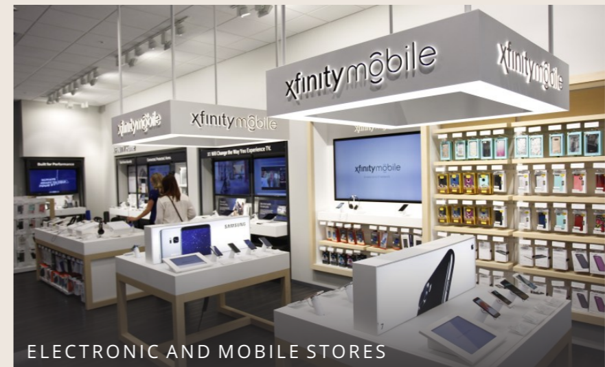
ELECTRONIC AND MOBILE STORES