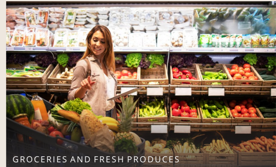
GROCERIES AND FRESH PRODUCES