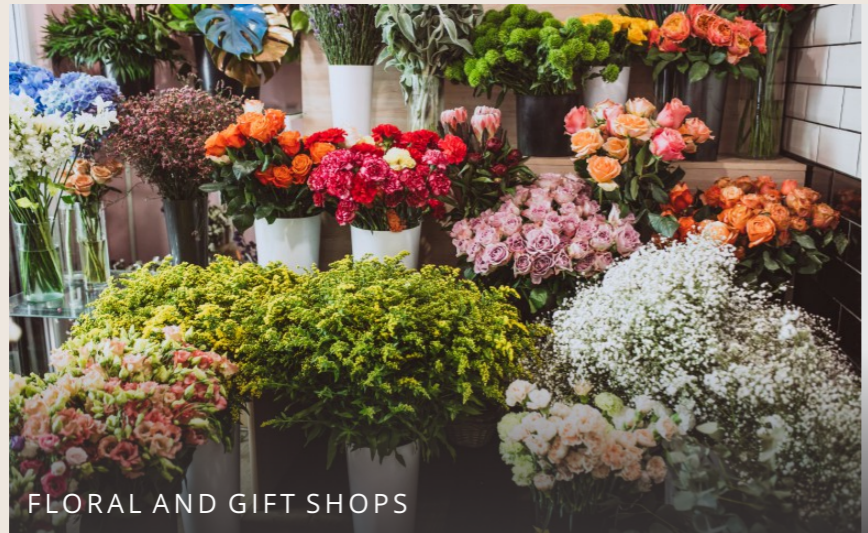
FLORAL AND GIFT SHOPS