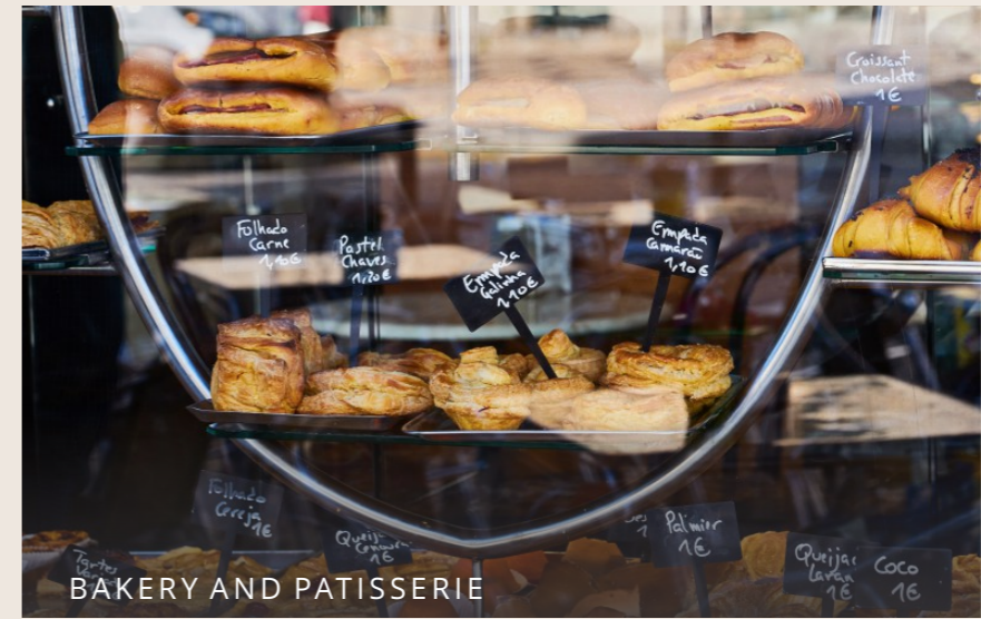
BAKERY AND PATISSERIE