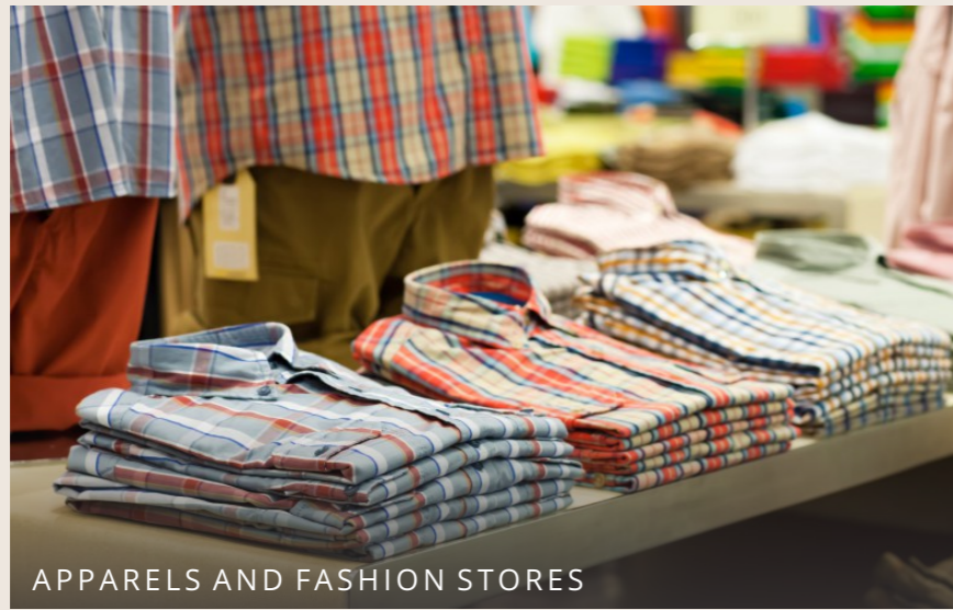
APPARELS AND FASHION STORES